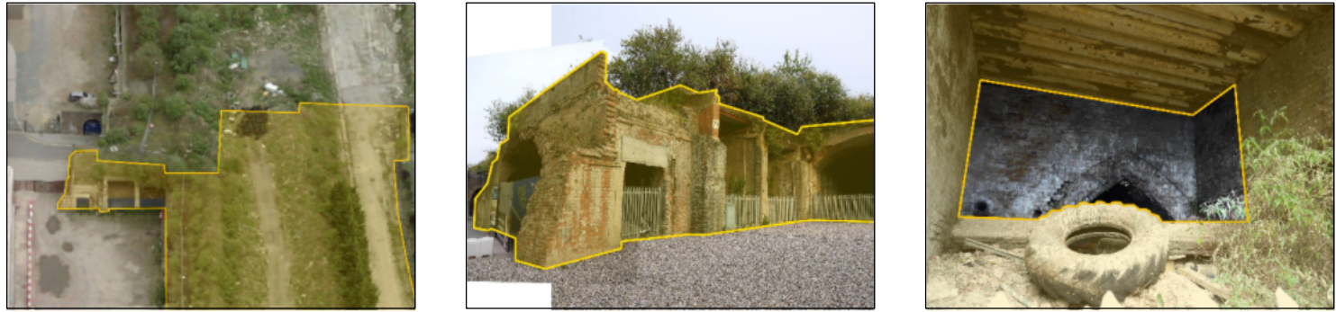
EXTENT OF EXISTING NON LISTED STRUCTURE ON THE NORTH END OF BRAITHWAITE ST TO BE REMOVED TO REVEAL THE LISTED VIADUCT (SHADED YELLOW).